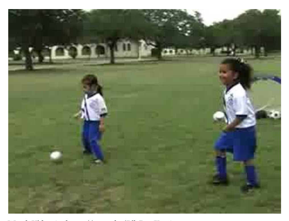
Watch Video At: https://youtu.be/BilrRgwXqqA

SETUP: The kids will be told and shown how to dribble around the field with the soccer ball toward the coach or other volunteer. When they get close they are to shoot the ball at the coach with their foot. Coach will react by jumping up in the air when struck and yelling "ouch" or "you got me."