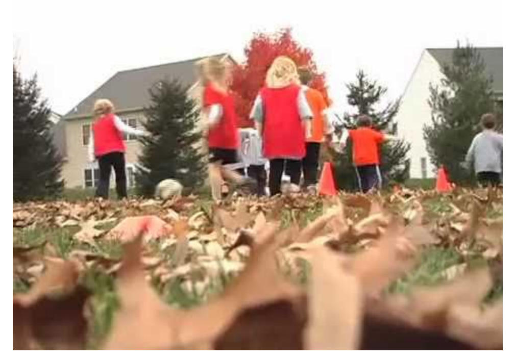
Watch Video At: https://youtu.be/JI9eHcBAYK4