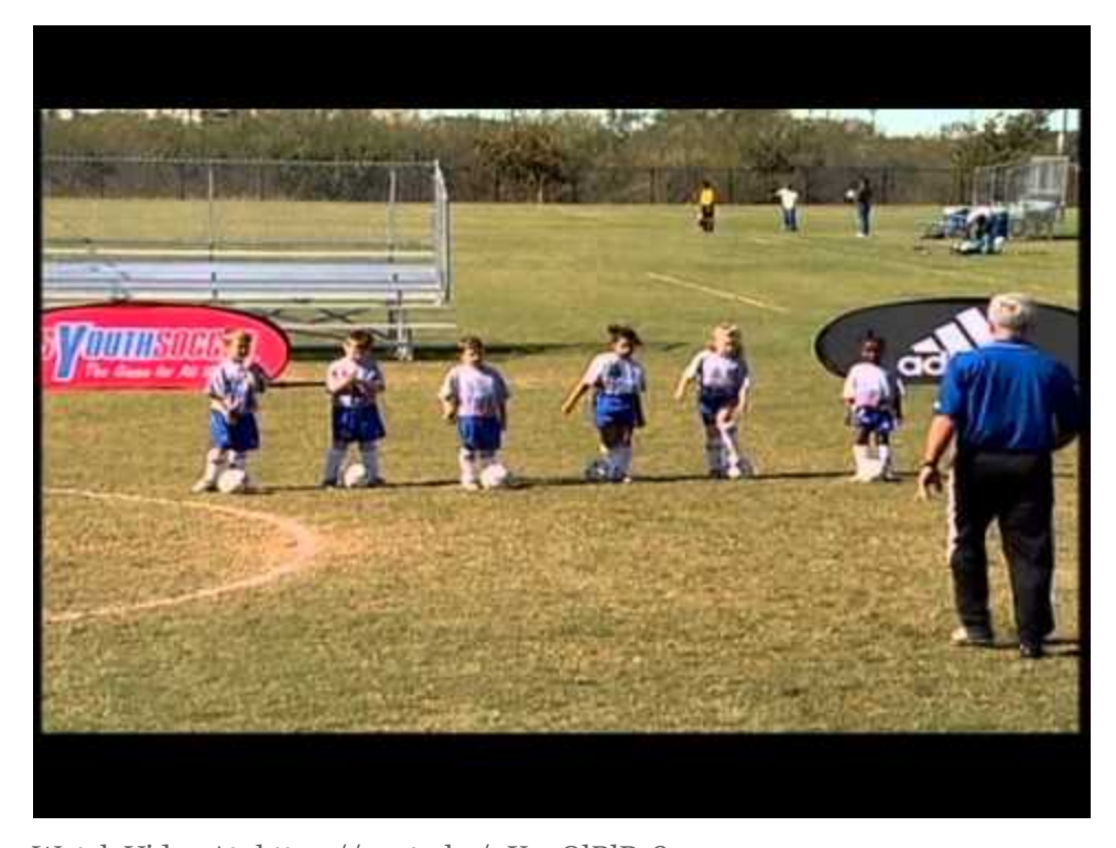
Watch Video At: https://youtu.be/3X37QlBlR-8

The video below gives you a good example of how you can play this game with young soccer players.